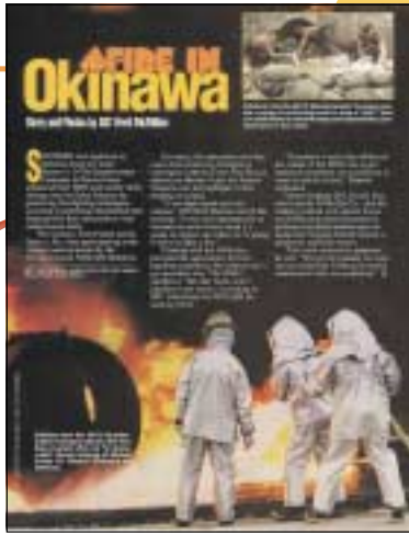
April 2000 Page 48

Training stories are first considered for use in our Postmarks department but are sometimes used as features. Feature material generally focuses more on unit missions or topics dealing with Army initiatives or policies.