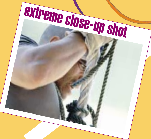
extreme close-up shot