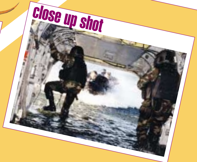
close up shot